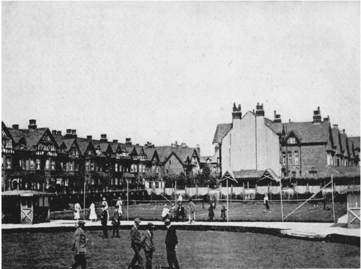
Victoria Gardens circa 1920