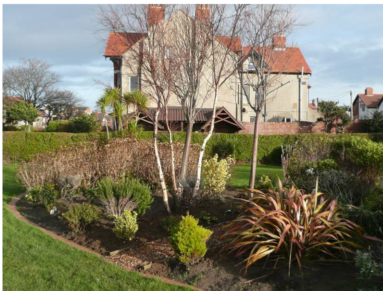
Central planting feature

Wirral Council has an Environmental Policy that the Parks and Countryside section adhere to (see Appendix D).