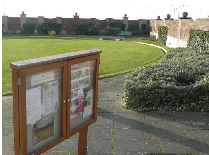
Main entrance information board

Wirral Council has a web site that has links to the Parks and Countryside information.