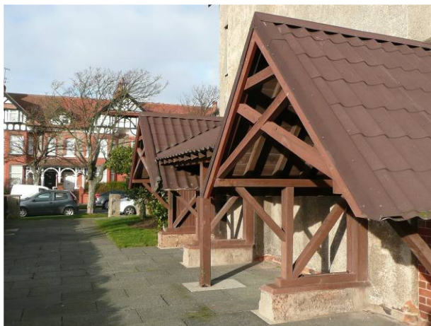
Victorian shelters in the Gardens

The historic perimeter brick and sandstone wall requires regular Ivy removal at various locations to the boundary with Victoria Drive and the Promenade.