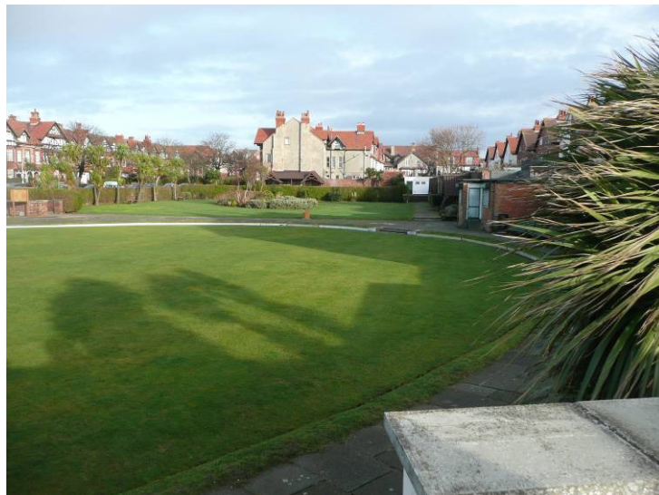
View from promenade entrance

There are three access points into the gardens with the main entrance being on Victoria Drive. Mobility impaired access is provided at this entrance and it is particularly valued by the elderly, however, at the base of the slope is the remains of a shed base that has a raised edge and this should be removed. A removable timber panel for vehicular access is on Victoria Drive but this is unattractive and a more suitable solution should be sought. The third access point is on the promenade via brick and concrete steps.