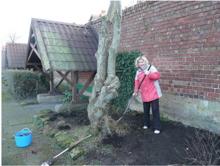
A Friend tending their plot

The community of Wirral both in general and in the form of constituted community and voluntary sector organisations are a key partner in relation to Wirral Council's parks service. This is represented in Wirral Council's vision "to provide and maintain high quality parks and open spaces in partnership with the local community".